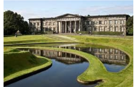
Scottish National Gallery of Modern Art