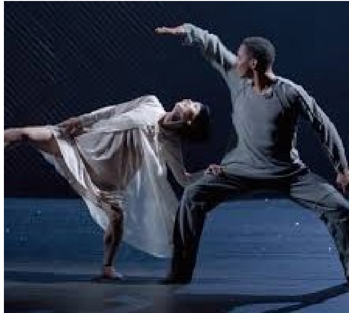
Mats Ek, Juliet & Romeo (2013)