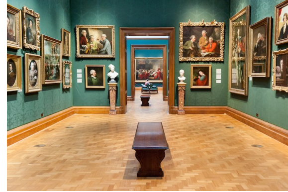
National Portrait Gallery