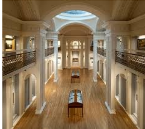
Talbot Rice Gallery