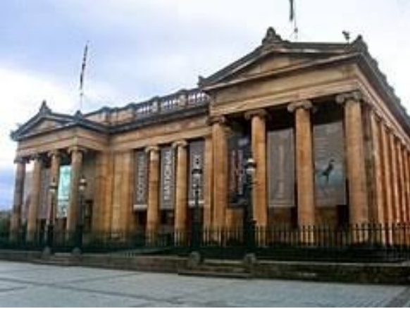
Scottish National Gallery