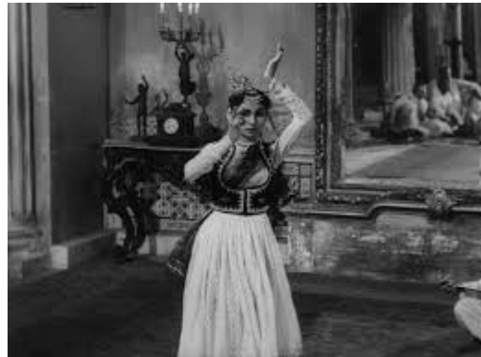
Satyajit Ray, The Music Room (1958)