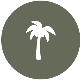
SAN JOSE (COSTA RICA)